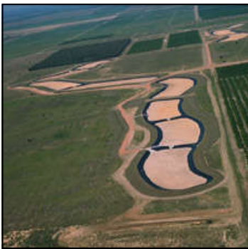
Typical Water Conserv II RIB Site

Helps to replenish the Floridan aquifer, through the discharge of reclaimed water to the Rapid Infiltration Basins (RIBs).