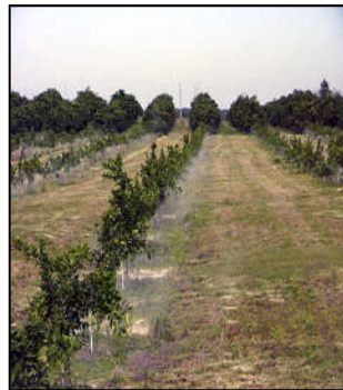
Customer Irrigation With Reclaimed Water Provided By Water Conserv II

Provides the customer highly treated reclaimed water that is free of virus and fecal coliform, and meets all the required Reclaimed Water Constituent Concentrations.