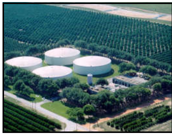
Water Conserv II Distribution Center