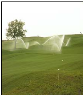
The OCNGC Uses An Average Of 2 MGD Of Reclaimed Water For Irrigation Purposes

Construction of the golf center and all related facilities began in October 1996 and was completed in January 1999.