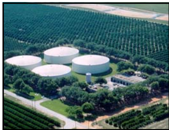
Water Conserv II Distribution Center