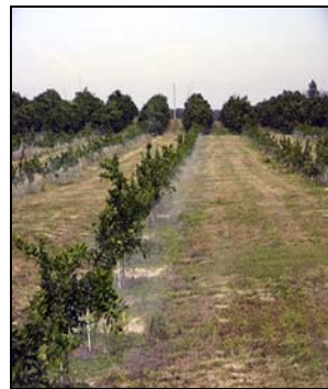
Customer Irrigation With Reclaimed Water Provided By Water Conserv II

The customer is provided highly treated reclaimed water that is free of virus and fecal coliform, and meets all the requirements of the FDEP Public Access treatment parameters.