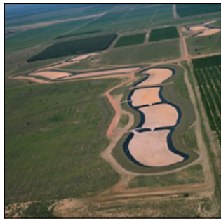
Typical Water Conserv II RIB Site

Helps to replenish the Floridan aquifer, through the discharge of reclaimed water to the Rapid Infiltration Basins (RIBs).